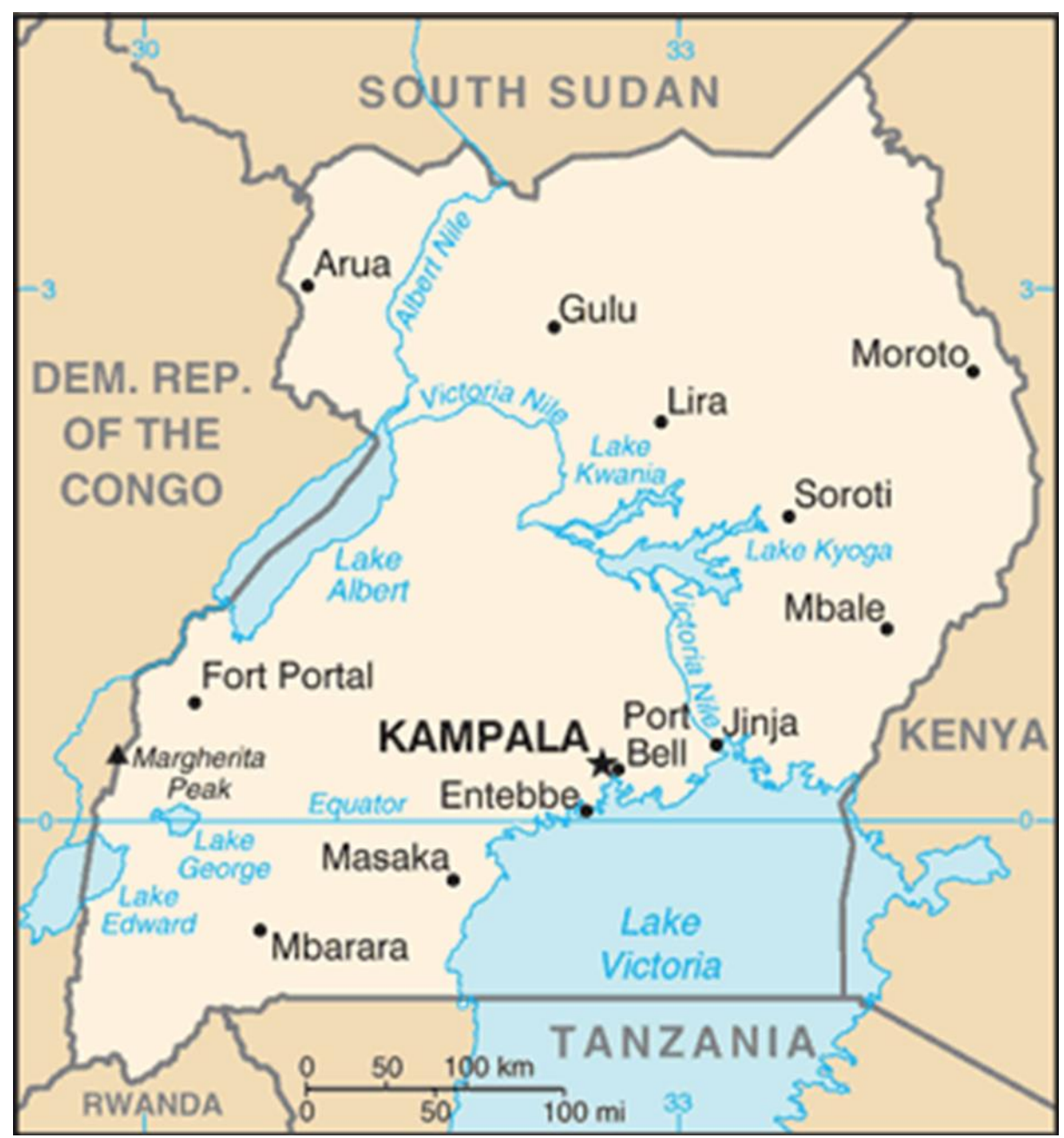
Figure 1: The map of Uganda showing the location of Mbarara District